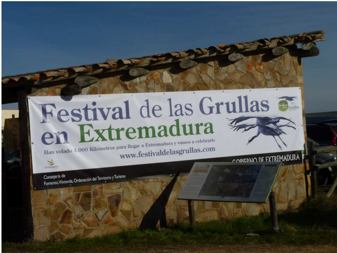
Crane Festival in Extremadura.